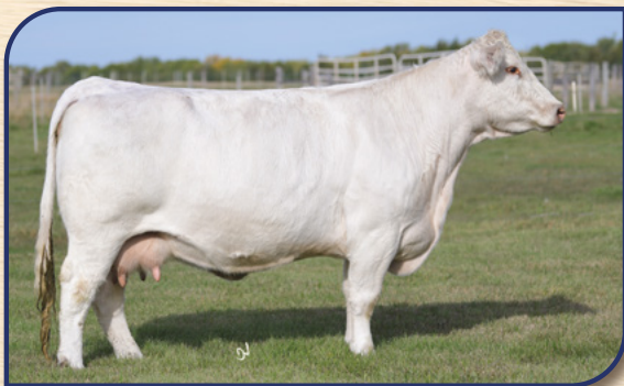
SCR MISS BLUE VALUE 1003 MATERNAL GRANDAM OF LOTS 20 & 22