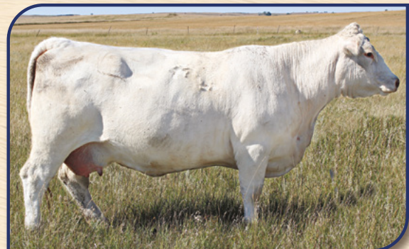
SCR MISS MILESTONE 7078P DAM OF LOT 22