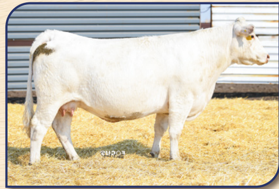
CCR MS GENERAL LEE 519 DAM OF LOT 42

42 SCR SIR JACK 3253P DOB: 4/17/23 REG: M993199 TAG: 3253 POLLED