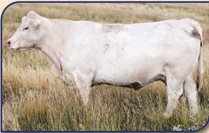
SCR MISS BUCKLE 7076P DAM OF LOT 65