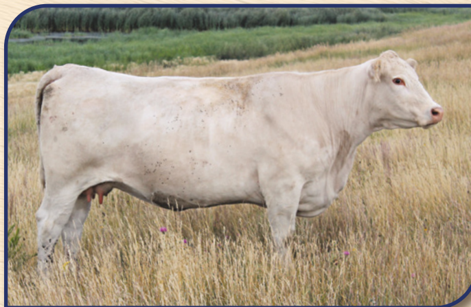
SCR MISS LEDGER 7164P DAM OF LOT 127