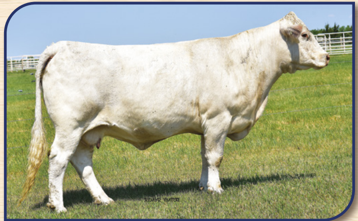
SCR MISS PLATINUM 6163 MATERNAL GRANDAM OF LOTS 88 & 94