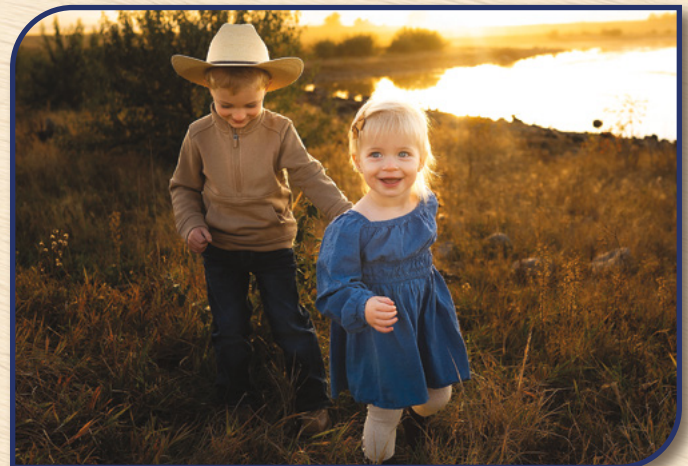
MARCH 7, 2025 AT THE RANCH BOWDLE, SD